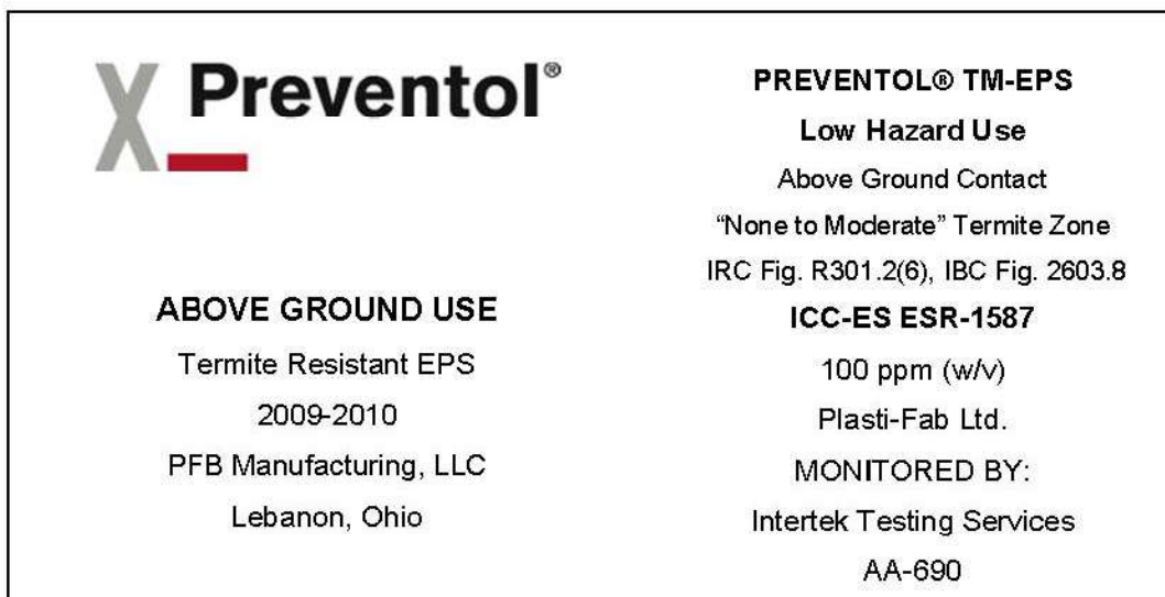
FIGURE 1—PREVENTOL® TM-EPS LOW HAZARD USE MARKING

1 The minimum dosage rate is expressed as ppm (parts per million) and is based on the final volume of molded EPS.