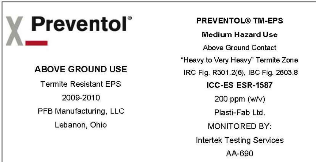
FIGURE 2—PREVENTOL® TM-EPS MEDIUM HAZARD USE MARKING